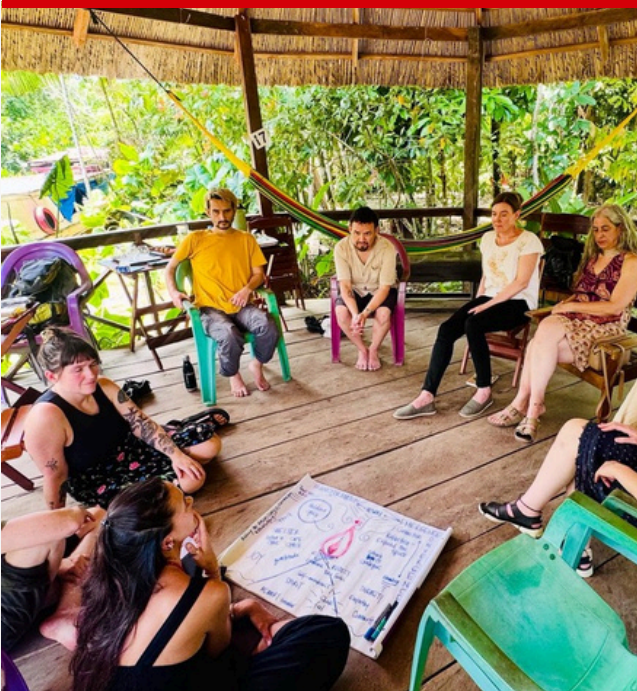
Left: The strategising space for the YLNM Face to Face meeting space on the island of Combú in the Amazon River Right: YLNM meeting 2nd day with regional contact coordination and members

In Belém we supported YLNM’s goals to “platform the experiences of our members on the frontlines of resistance against extractivism, debunk the greenwashing, expose the false solutions for what they are, and to build alliances with the social movements of Brazil and the world.”