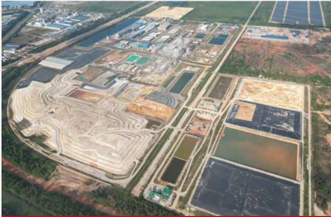
Left: Mounting waste dumping area on a flood prone peat swamp in a seasonal wet monsoon region at Lynas Malaysian plant premises.

Lynas is the first rare earth corporation that has secured multi millions public funds. Firstly, a generous soft loan from Japan to complete the construction of the controversial secondary beneficiation plant in Kuantan, Malaysia, created the first supplier of rare earth outside of China. In total, Japan provided close to half a billion in loans and equity for Lynas to date. As trade tensions between US and China deepened, the US government has invested over US$350 millions in Lynas primarily to ensure that its weapon industry has a secured non-Chinese supplier.