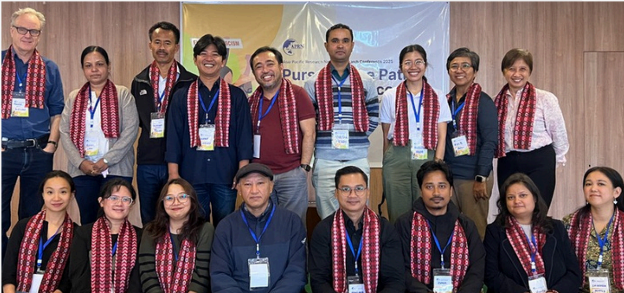
Attendees of the 2025 Asia Pacific Biennial Research Conference

Pursuing the path towards peace: People's resistance & collective solutions.