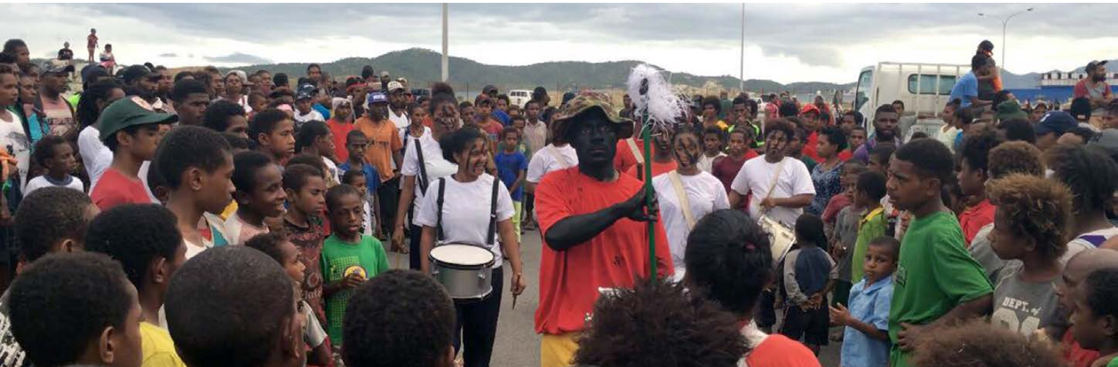
Around 200 Paga Hill community members staged a peaceful protest to seek justice from the illegal evictions and demolitions of their community in downtown Port Moresby, Papua New Guinea. The youth perform as the Paga Mothers hand over The Opposition film to PNG National Central District Governor, Powes Parkop requesting their concerns of human rights violations be heard. 13 May 2018.

“I couldn’t believe our leaders would suppress law to defeat our own country men on our own land. I feel I can’t trust our government of Papua New Guinea or foreign corporations after seeing what has happened to the Paga Hill community”.